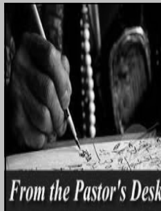
From the Pastor's Desk